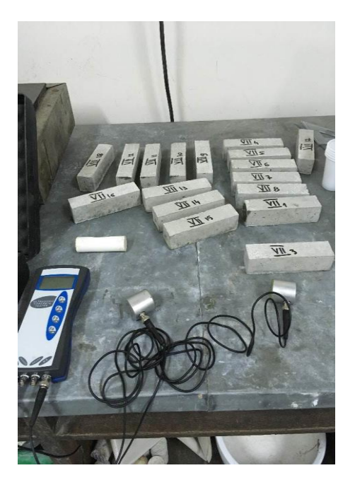
Figure 4. Ultrasonic pulse velocity measurement on 4x4x16 cm prisms