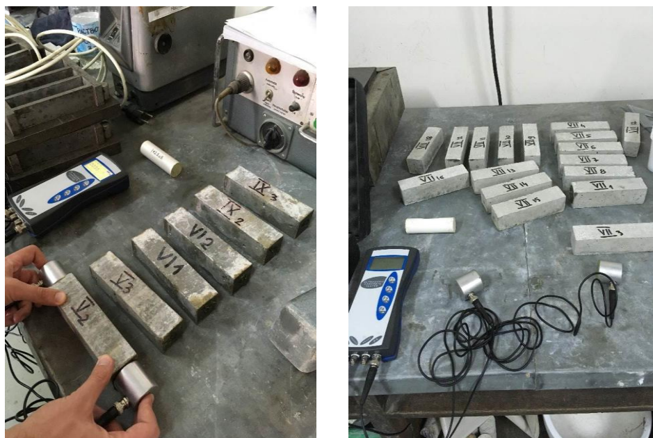
Figure 4. Ultrasonic pulse velocity measurement on 4x4x16 cm prisms

values, a proper correlation between these two properties could not be formed. Ultrasonic pulse velocity measurement is shown in Figure 4.