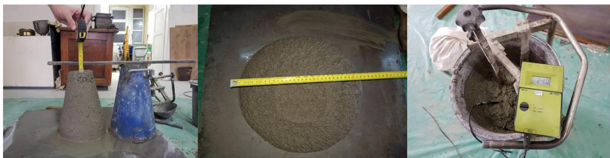
Figure 2. Measurement of consistency and temperature of the fresh concrete mixtures