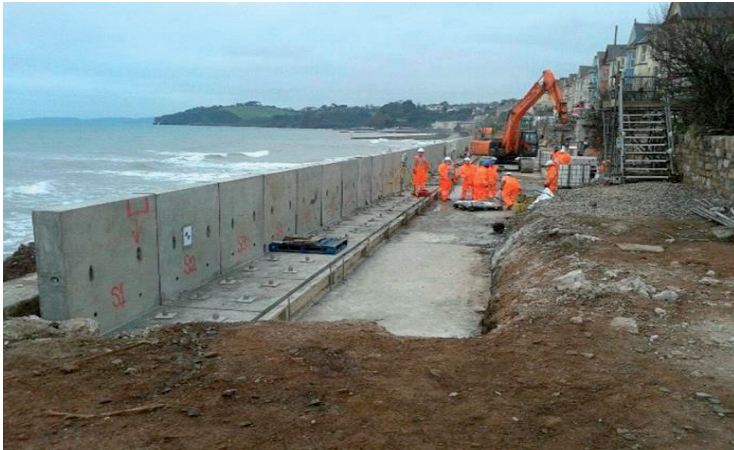
Figure 3. Constructions erection aiming at high water protection

This course is designed to include description of various flood protection measures and the need for the establishment of effective flood protection system. The flood protection system should be adjusted to provide a robust defense of urban areas and valuable assets. The course shall also highlight increasing tendencies of flood probability and vulnerability. Innovative flood protection measures will be elaborated, including the application of the “L” elements, a validated European patent. Water holding barriers and measures for reinforcement of dykes will be also presented, as well as the procedure for establishment and implementation of effective flood protection system.