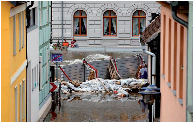
Figure 4 . Facilities for fighting floods in urban conditions

Green infrastructure (GI). Integrated urban water management (IUWM). Low impact development (LID), low impact urban design and development (LIUDD). Stormwater control measures (SCMs). Sustainable urban drainage systems (SUDS). Practices in water sensitive urban design. Problems to manage. Case studies and examples of urban flood protection measures (active and passive). Highly responsible technical-economical decisions. Risk perception, acceptance and communication. Preparation for defense. Post event tasks. Insurance against damage. Risk perception, acceptance and communication. Urban flood risk management. Urban land use.