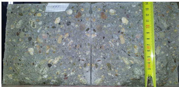
Figure 3 – Maximum water penetration measurement obtained on a sample from SCC-RB series

Figure 3 shows the measurement of the maximum penetration obtained on one of the samples from the series with ground recycled concrete.