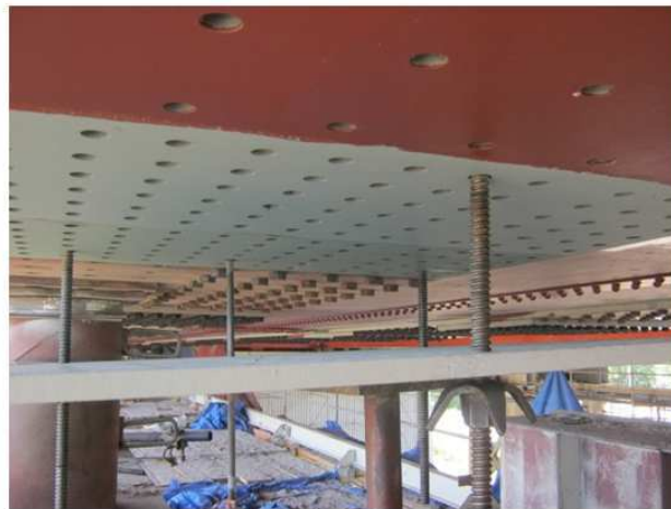
Figure 2: Reconstruction of the „Gazela“ bridge in Belgrade – implementation of zinc-silicate coating „Resist 86“ as anti-corrosive protection of friction surfaces [09]