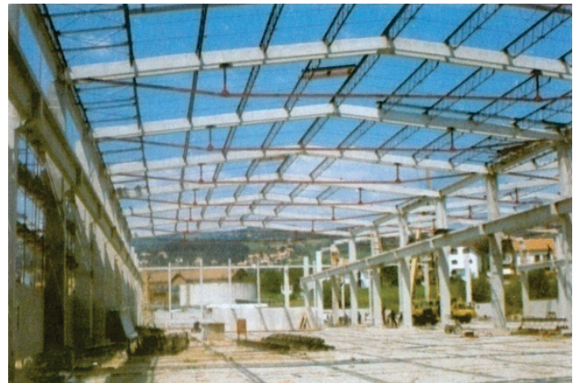
Figure 3 Industrial hall under construction

The proposed method of the fuzzy AHP was applied for the choice of the optimal structural reinforced concrete system of an industrial two-part hall with dimensions at the base of 2 \times 24,50 \text{ m} \times 120,00 \text{ m} . This hall under construction is shown in Fig. 3. The choice of appropriate structural system and technology of construction, which affects costs and speed of construction, is one of main tasks of the design and construction team. The period of design and construction was limited on seven months, according to the contract between the investor and contractor.