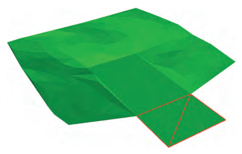
Figure 3: Visualization of the modified terrain model.