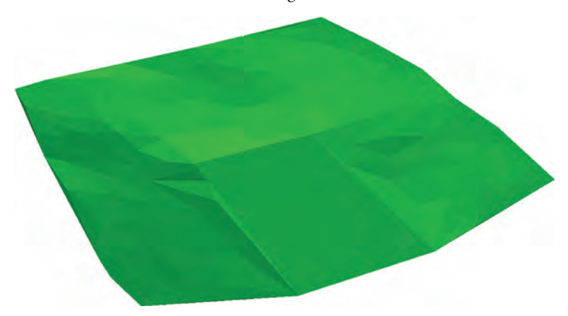
Figure 1: Visualization of the terrain model.

Hereafter, as the input data, we used data from the terrain model, building units and utilities converted to JSON documents. Figure 1 shows the terrain model which has a small valley prepared for building infrastructure and which is built from the 237 triangles.