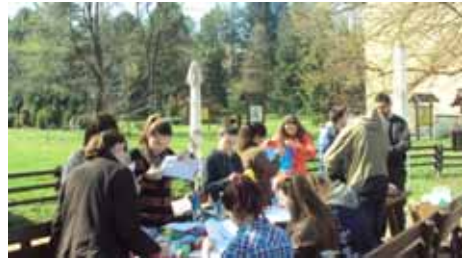
Figure 2: Students of Landscape architecture made geometrical models

On the first year of studies students learn Geometry by using paper and pen as well as multimedia DVD. Students also made some geometrical models using paper in conventional way (Figure 2.).