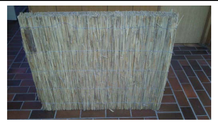
Figure 5. Wall panels made of cane

Савремена достигнућа у грађевинарству 20. април 2018. Суботица, СРБИЈА