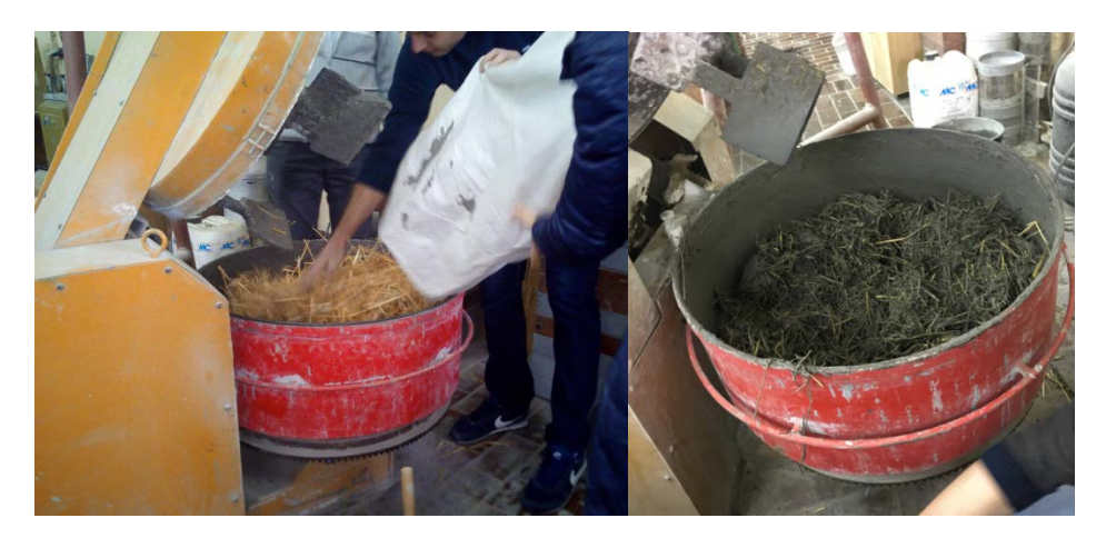
Figure 1.Students of Faculty of Civil Engineering in Subotica, on the subject Traditional materials processing wheat straw by treating in a mixer with impregnating materials to achieve strength after the compressing phase (straw, cement, lime, pucolic powder, water, chemical impregnation agents)

Serbia is an agricultural country where significant grain cultivation. Straw can be a good raw material and source of renewable material for the construction of buildings. The straw-bale construction can be carried outwith bales bound to standard dimensions during mowing or later. During the construction of walls, the surface of the compressed straw-bales should be treated in a thin layer with a roller or immersed in a liquid mixture of chemicals for impregnation and binder that will increase the strength. Impregnation is necessary for several reasons. The impregnating material should be hygroscopic to extract moisture from the interior of the straw wall. Another way of using straw is to cut to length aprox. 5 cm to 10 cm and then treat it in a mixer with an impregnation agentand cure after placing.