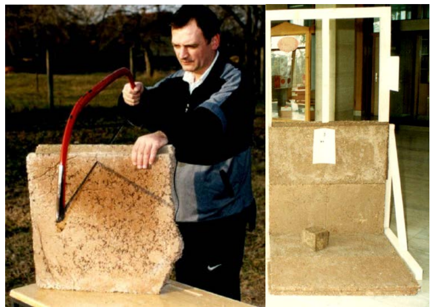
Figure 9.Hemp-creteelements ready to be used for separating walls and for lightweight and warmscreeds

Hemp - concrete after mixing in the mixer should have a consistency class \leq F4. Liquid consistency is not suitable for this type of concrete because the shiv is lighter than water and it would be separated from the pasteon the surface along with water. Hemp-concrete can be placed in the same way as ordinary concrete. Especially interesting would be the pressing intobuilding blocks. Hemp-concrete was treated as lightweight thermal insulating and sound insulating concrete in 1997 on GFS. In 1998, a patent was filed in which the claim No. 10 describes a new impregnation technology and a mixture of hemp-concrete. This patent was published in 2000 by the world organization WIPO, [2].