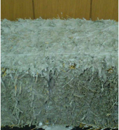
Figure 3. Surface treatment and impregnation of straw-bale, performed by students of the Faculty of Civil Engineering in Subotica on the subject Traditional Materials