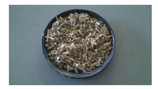
Figure 7.Shiv granulate obtained by grinding hemp stems

Hemp stem have a thickness up to 15 mm and it is ground after the removal of hemp fibers. The granulate obtained after grinding of the stem is called shiv. One hectare of land can provide shiv enough to make the walls of a house of 200 \text{ m}^2 . The shivhavegranule size mostly from 5 mm to 30 mm.