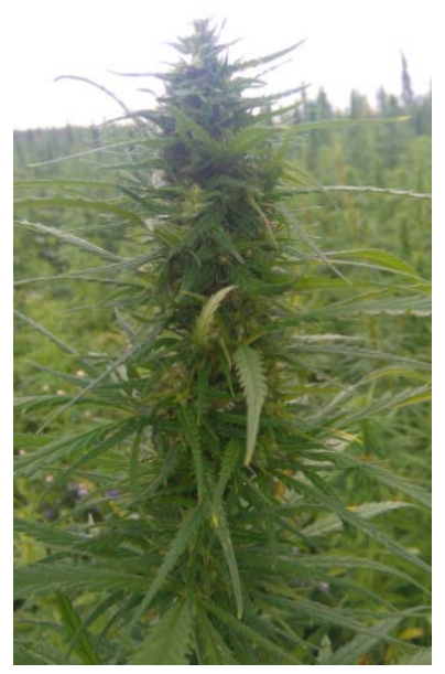
Figure 2. Industrial hempcan be applied in several different industries: textile, food, pharmaceutical, automotive and even in the construction industry (www.udruzenjekonoplja.net)

automotive industries and the seed is used in the food industry for the production of edible oil. The hemp stem, as a by-product, can be grinded, and in this way, a shiv is obtained, an excellent lightweight aggregate for the production of lightweight concrete and mortar. It is possible to use a combination of shiv and milled straw in a way that he larger aggregates up to 15 mm are shiv and the smaller aggregates are made of straws up to 5 mm long.