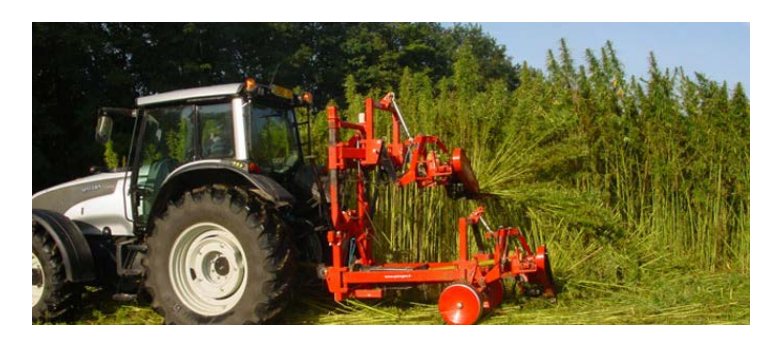
Figure 6.Mowing of industrial hemp is the first stage of processing(<u>www.agrosmart.net</u>)

One of the most important plants is industrial hemp, from which various products can be made in textile, food, pharmaceutical, automotive and even in the construction industry. Industrial hemp is planted in fields and can be even harvested two times over a year. Hemp can grow up to 3.5 meters high, Figure 6.