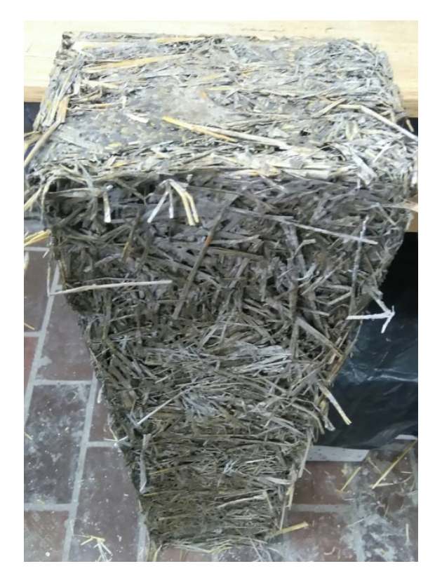
Figure 4. . Pre-treatment and impregnation of straw as a fibrous aggregate in the mixers and afterwards, pressing into the masonry elements were made by students of the Faculty of Civil Engineering in Subotica on Traditional Materials

Elements made of straw built up into the walls would not have a load-bearing role, but they should be treated that they in order to avoid subsiding under their own weight. Thermal conductivity measurements were performed and these pressed straw elements have a value of 0,1163 = W / mK with density of \gamma_m = 655 \text{kg} / \text{m}^3 \text{at} humidity Ha = 2,5%.