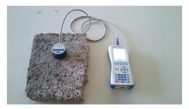
Figure 8. Measuring of the heat conductivity on the hemp-crete