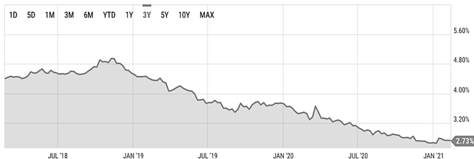
Figure 1. Interest rates from 2018 to 2021 [6]

There are several channels through which the financial crisis, the associated increase in risk aversion and the ensuing recession may affect PPP programs. The channels include upward pressure on interest rates (see Figure 1), decrease in the availability of credit, the real effects of the economic slowdown on revenue cash flows and unforeseen exchange rate movements.